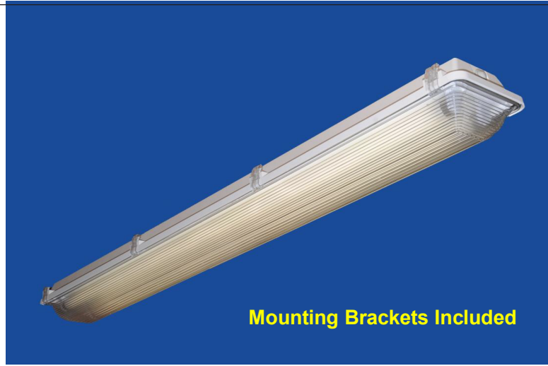
Mounting Brackets Included